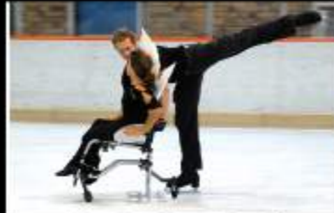
S.P.O.R.T Ice Wheelchair Innovations To Elevate Sport and Art