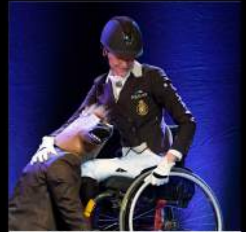
S.P.O.R.T Production Dancers + Athletes